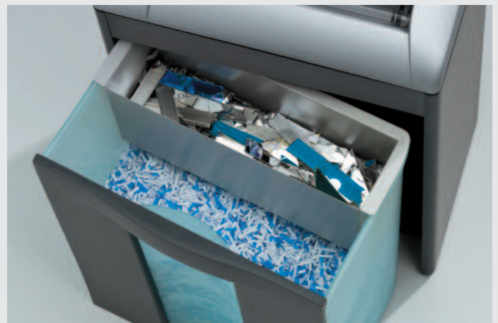
Removable shred bin: With large window showing fill level and magnetic switch for automatic stop if the full shred bin is removed.