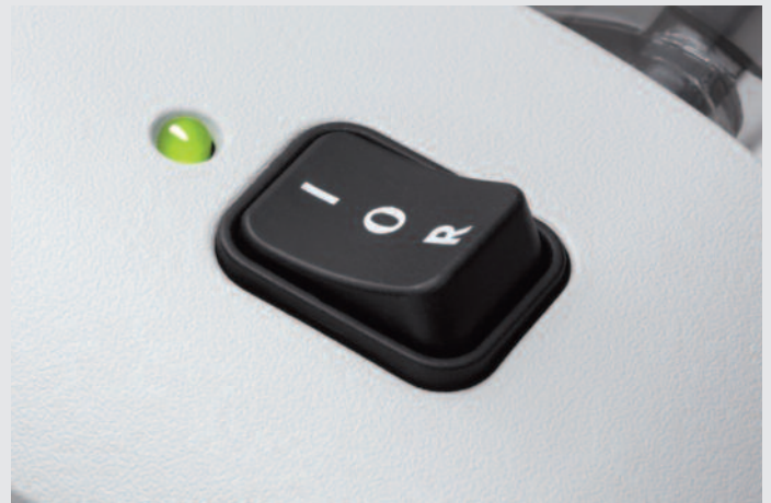
Easy operation for convenient shredding: Multifunction switch in combination with a photo cell for automatic start / stop.