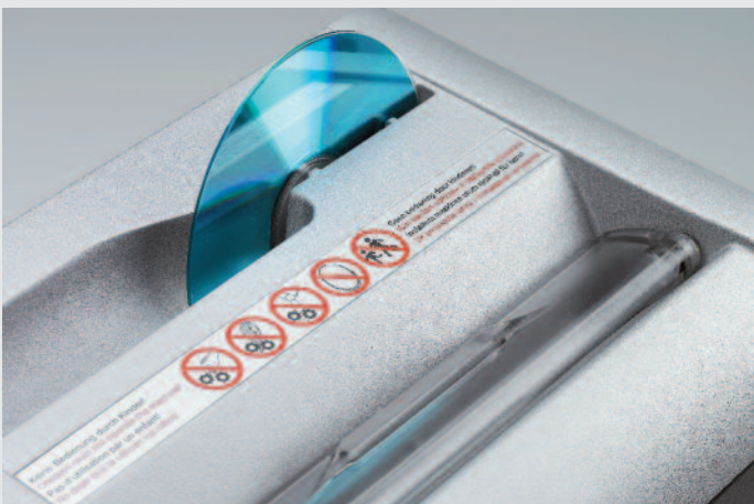
Separate feeding slot for the disposal of CDs and DVDs with a second shredding head. Photo cell for automatic start and stop.